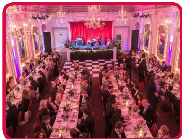
Main Hall - Set up