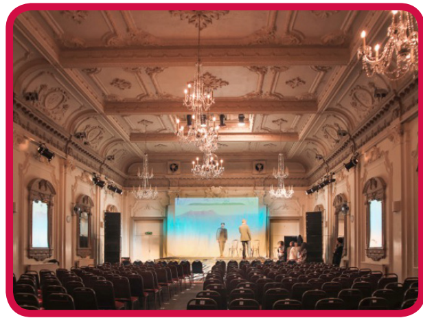
Main Hall - Set up